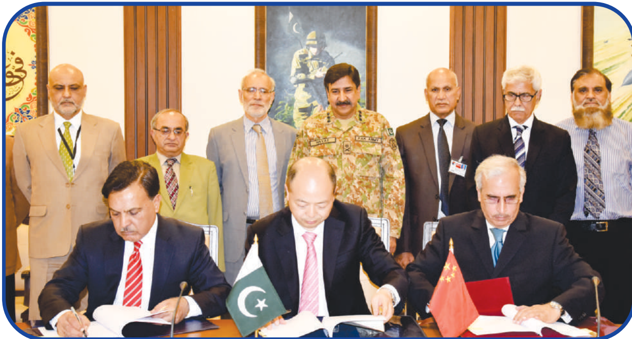
SHAREHOLDERS AGREEMENT SIGNING CEREMONY