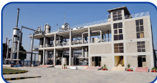
NEW FORMALDEHYDE PLANT