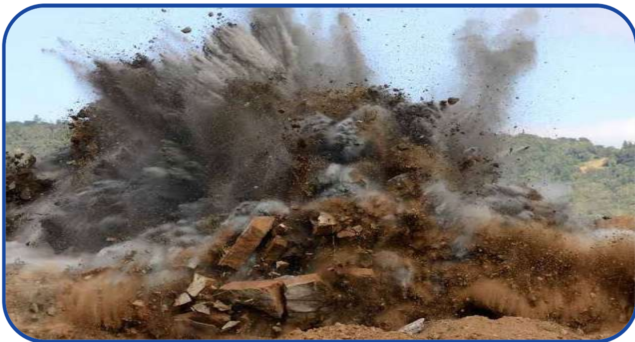
OUR PRODUCT'S PERFORMANCE IN FIELD