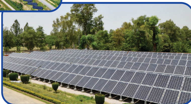
125 KW INSTALLED AT WAH NOBEL HEAD OFFICE