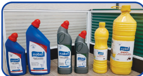
COMMITTED TO EXCELLENCE