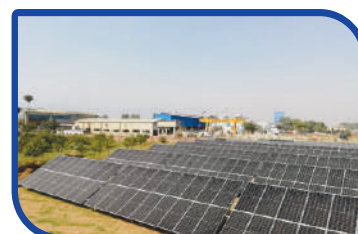
250 KW SOLAR POWER PROJECT AT HATTAR